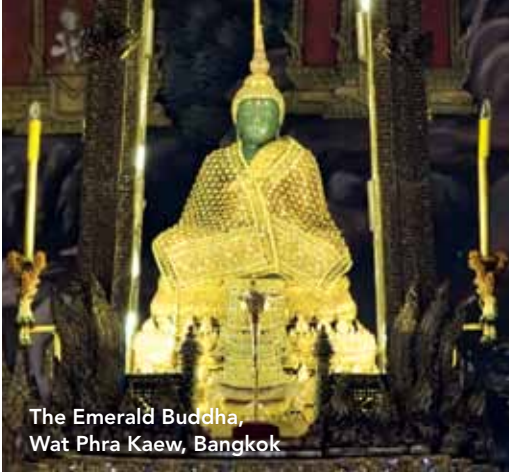
The Emerald Buddha, Wat Phra Kaew, Bangkok