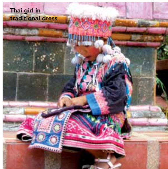
Thai girl in traditional dress