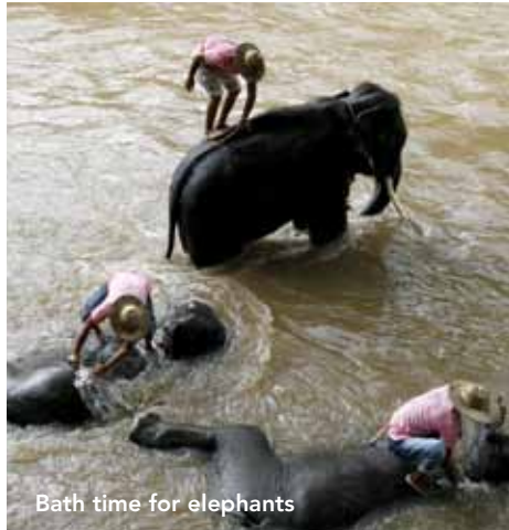
Bath time for elephants

Nestled among northern Thailand's untamed wilderness lies ancient Chiang Rai . First established in 1262, it is currently one of the fastest growing towns in the nation. Accessible via train, car and Chiang Rai International Airport, this town is an ideal starting point for travelers looking to explore the Golden Triangle , an area that covers 75,000 square miles and includes parts of Thailand,