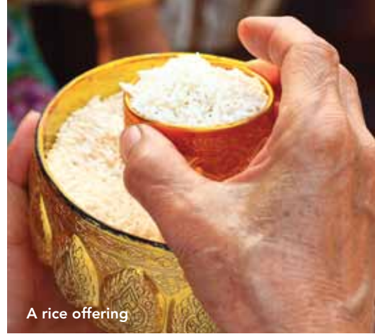
A rice offering