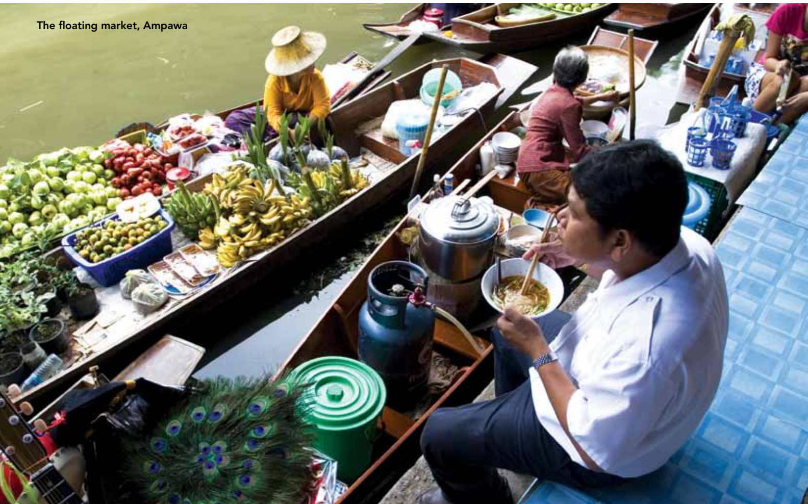
The floating market, Ampawa