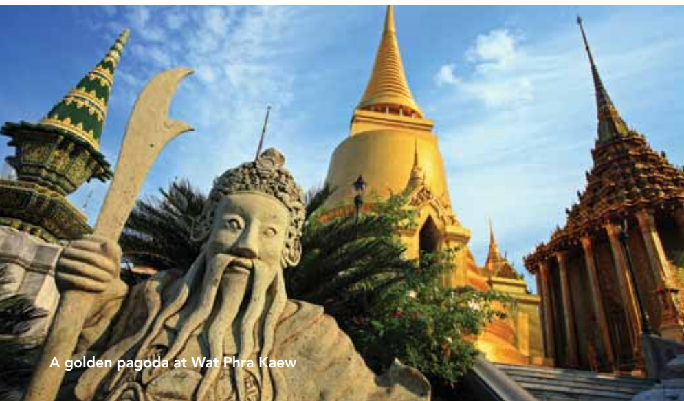
A golden pagoda at Wat Phra Kaew