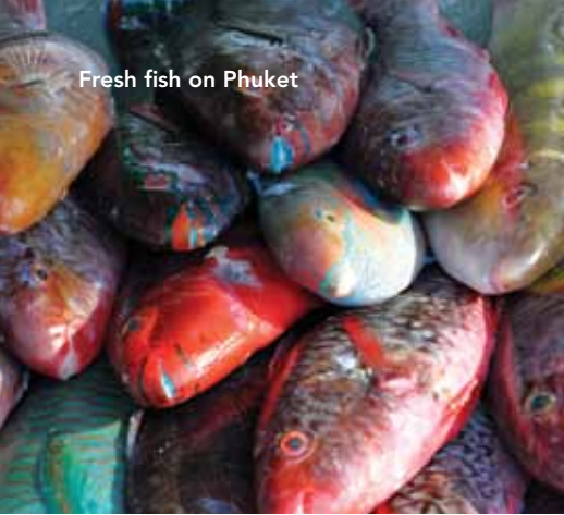
Fresh fish on Phuket