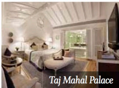
Taj Mahal Palace

Falaknuma Palace sits amongst the clouds, 2,000 feet above the city. At this "mirror in the sky," a personal butler is on hand for each guest staying in one of the 60 rooms.